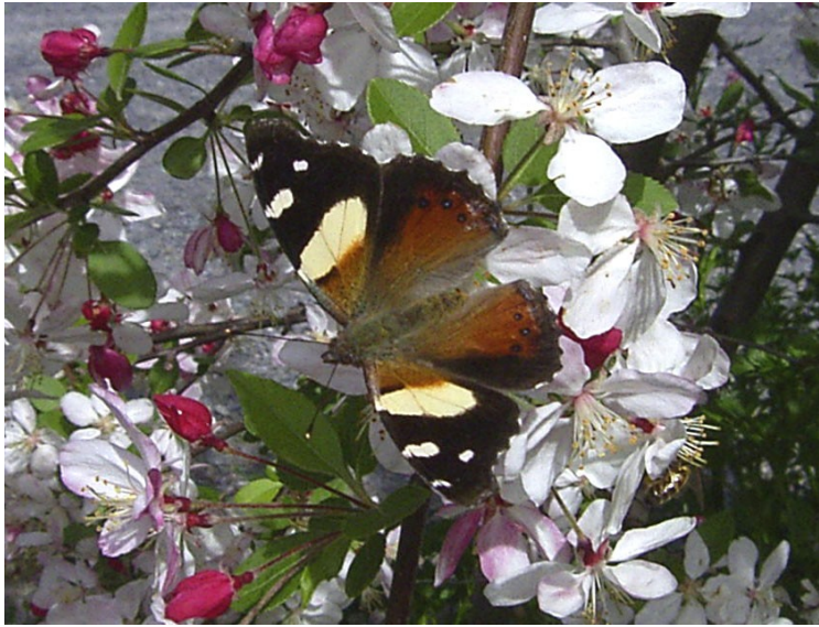
Yellow Admiral feeding on blossom