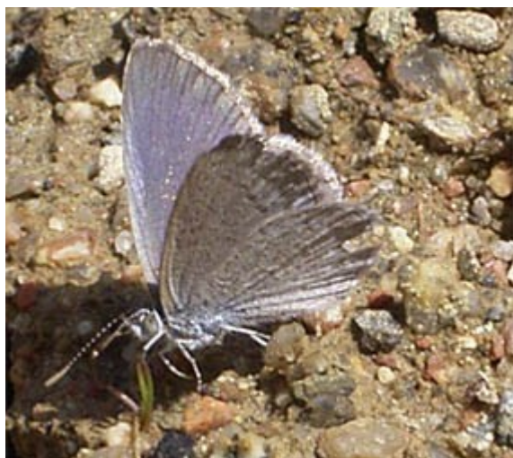
A Common Grass Blue seeking moisture from damp gravel