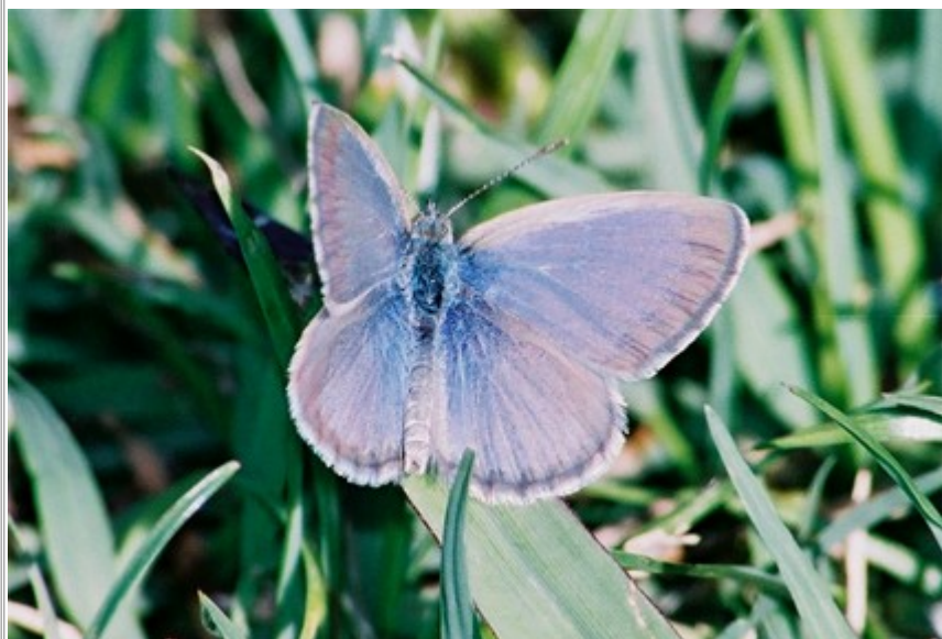
A female common grass blue (broader dark wing margins and slightly larger)

This little grey-blue butterfly is the commonest species in Australia. It is found throughout the continent wherever there are legumes, either native or introduced (It is also known as the Lucerne Blue, a name which reflects its tastes). Since so many legumes grow among the grass, it is generally found fluttering low on the lawn or in the flower garden. It looks more grey than blue when flying, but if it opens its wings, the pretty purplish upper side is visible.