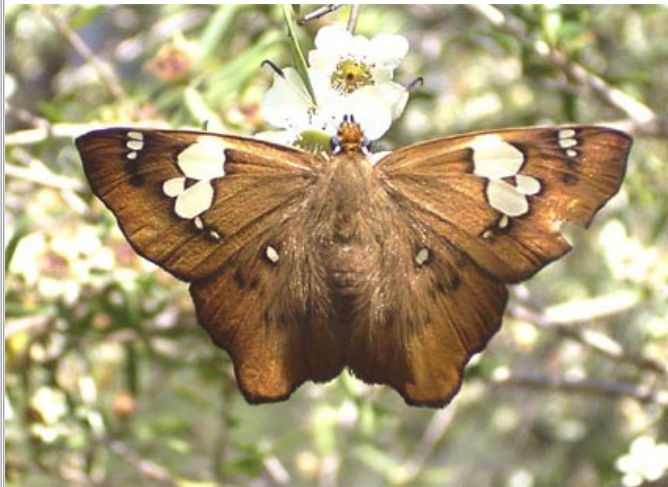
A female Bronze Flat feeding from a Tea-tree flower

Unlike most butterflies, the 'Flats' generally rest with wings outspread. Other types generally only do this when they are cold and need to warm up, although the Meadow Argus is often seen with wings out-spread. Flats belong in the Family HesperIIDae, many of which rest with at least the hind-wings flat.