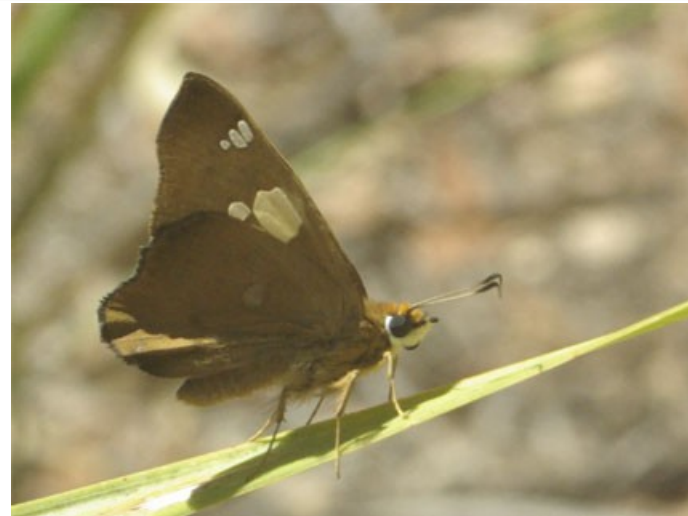
Underside of a Bronze Flat